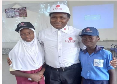
Christian and Muslim new friends with the CEO

GROWTH: Four indices convince us that I-VEED is growing: First, numerically, we expanded the number of our beneficiaries from 100 to 150 in the last academic year. Second, we have supplemented our financial support with psychological support to our beneficiaries through our trauma-healing, peaceful co-existence, and academic success seminars. We did this by bringing the students together in three major locations so they meet one another and draw strength from each other. Third, our publicity is effective, as people have become more aware of our work, through which more of such needy children as the ones I-VEED supports are brought to our attention. Fourth, our structure is becoming strengthened and more localized. You can fill our Membership/Donor forms on our website ( https://www.i-veed.org/membership-donors-form/ ), if you want to be a member, volunteer, to stay updated on I-VEED's progress, or you want to donate once, monthly, yearly, or occasionally.