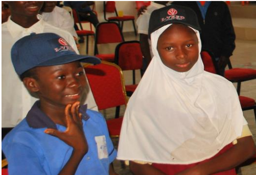
Christian and Muslim new friends

STORY: During one of our recent workshops for our beneficiaries, we encouraged each student to get to know another beneficiary from a different area and possibly different religion from theirs. Two little Christian and Muslim girls really touched my heart by the warmth of friendship that they immediately started, such that after the entire program, they came together to meet me, saying they want to have a photograph together, and they have exchanged their parents' mobile contacts because they really want to stay in touch as friends. One of the girls I know personally how her father was brutally killed when their town was attacked. Normally, you would expect her to be full of hatred towards anyone from the same religion as her father's killers. Yet, after we emphasized forgiveness, reconciliation, and changing the culture of hate and violence, the two little girls embraced each other warmly and want to remain friends for life irrespective of their religious differences. If such mutual love, respect, and tolerance is nurtured, these girls will grow up and teach their children tolerance because they have practiced it and they have a friend from the other faith. This is what I-VEED envisions and works tirelessly to nurture.