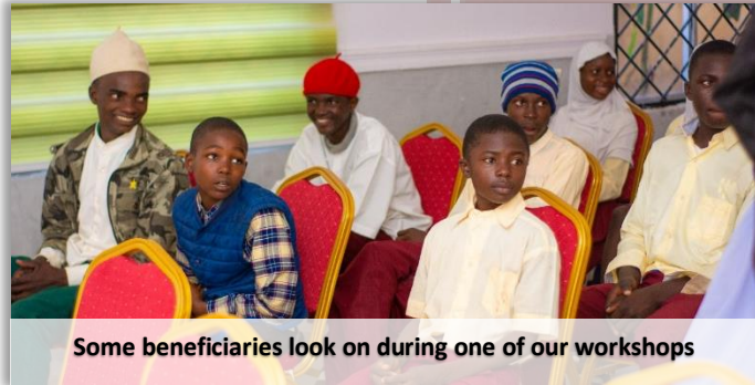
Some beneficiaries look on during one of our workshops