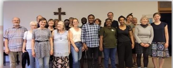
Some attendees at the Freundeskreis meeting in Mainz

Check our website to see the names and profile of the Organizational Team of I-VEED Freundeskreis Germany.