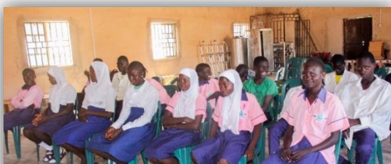
A cross-section of beneficiaries/participants