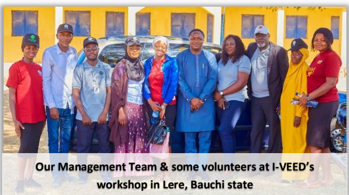
Our Management Team & some volunteers at I-VEED's workshop in Lere, Bauchi state