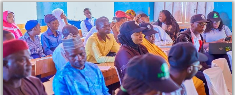
A cross-section of participants at one of our trauma healing workshops