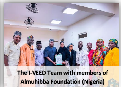
The I-VEED Team with members of Almuhibba Foundation (Nigeria)