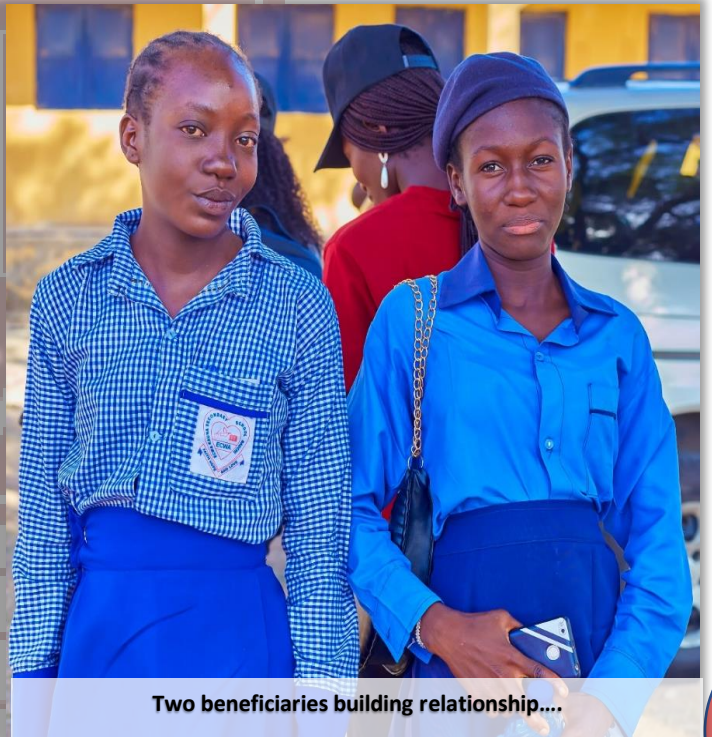
Two beneficiaries building relationship....