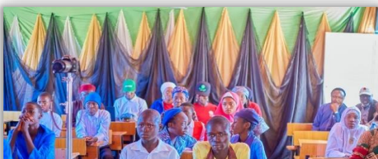
A cross-section of beneficiaries/participants