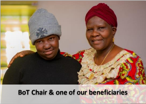
BoT Chair & one of our beneficiaries