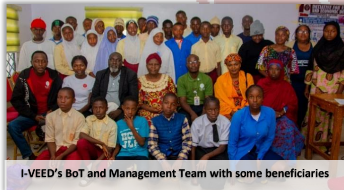
I-VEED's BoT and Management Team with some beneficiaries