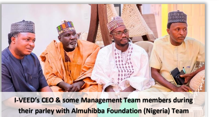
I-VEED's CEO & some Management Team members during their parley with Almuhibba Foundation (Nigeria) Team