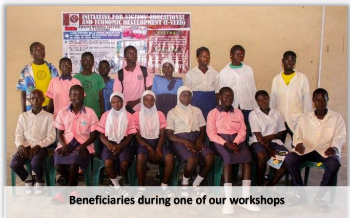
Beneficiaries during one of our workshops