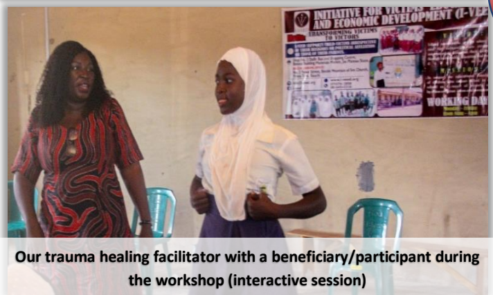
Our trauma healing facilitator with a beneficiary/participant during the workshop (interactive session)