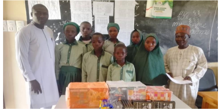
Our beneficiaries from SUBEB Wamdeu and I-VEED staff during disbursement.