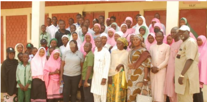
I-VEED Team, staff and students of schools in attendance at the Trauma Healing workshop in Gombi