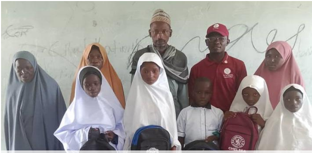
A Management staff with beneficiaries and staff at GJSS Gital, Tafawa Balewa, Bauchi State during the 2025/2026 disbursement