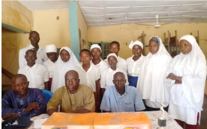
Our beneficiaries from Government Secondary School (GSS) Garkida with their teachers.