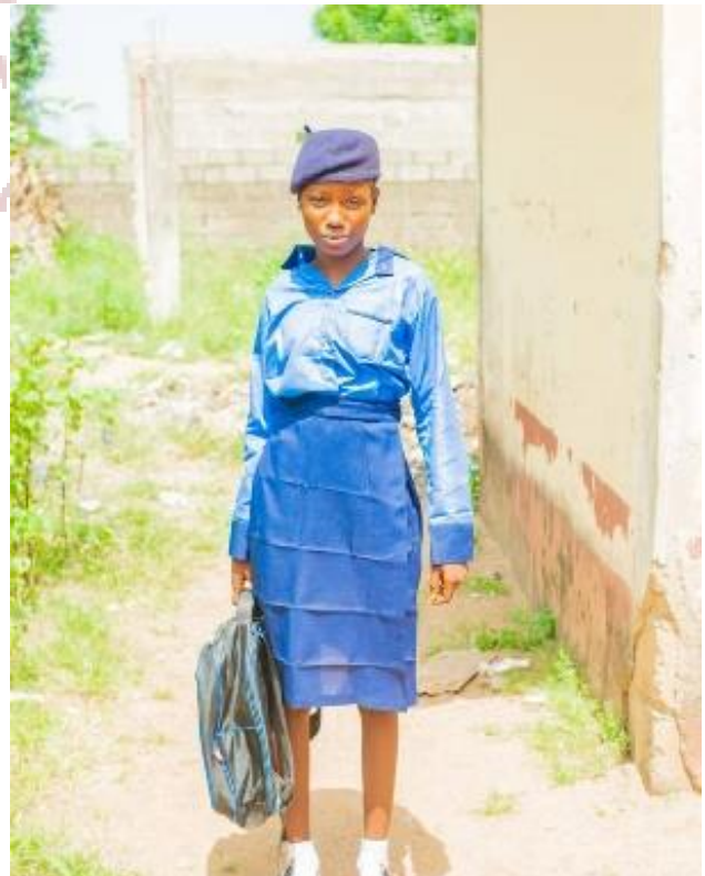
Good to go – An I-VEED beneficiary ready for school

The 2025/2026 school year was another busy period for the I-VEED team in the states that we cover. New beneficiaries were identified, selected and required fees paid for, alongside the continuing students. Reading materials and uniforms were also provided. Workshop was held in Adamawa for beneficiaries. These pictures show some team members with beneficiaries and their school head.