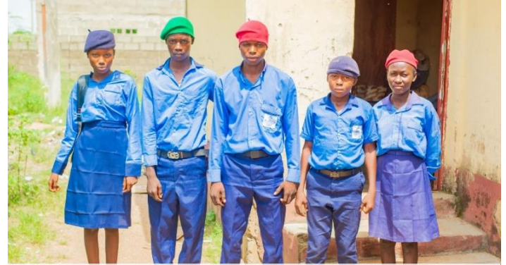
I-VEED beneficiaries at St. Paul Academy Tafawa Balewa, Bauchi state. Those with green and red Barretts are prefects, a testament to their educational, moral and leadership qualities.