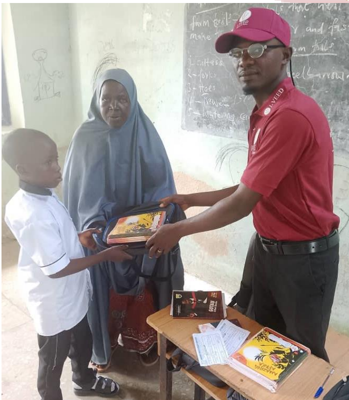
Management staff presenting learning materials to a beneficiary at GJSS Gital, Tafawa Balewa LGA, Bauchi State