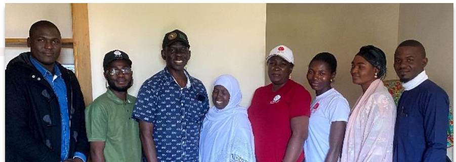
The Management Team members who attended the training on Financial Best Practices

TEAM TRAINING: As part of our strategic plan and further development of our team, the I-VEED Management Team was trained on Financial Best Practices as well as Measurement and Evaluation in the context of development work such as I-VEED's. The two-days training took place in August 2025 in Jos, Nigeria. It was an intensive further training on financial budgeting, documentation, transparency, measurement and evaluation of impact. Beyond its direct relevance for I-VEED's work, the workshop counts for the overall further development of our team members.