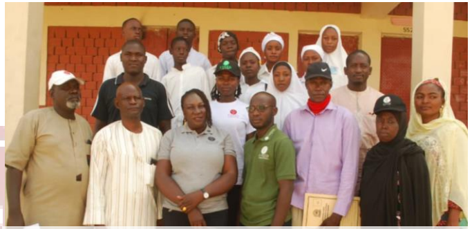
I-VEED Team with staff and students from Government Secondary School (GSS) Garkida at the workshop in Gombi