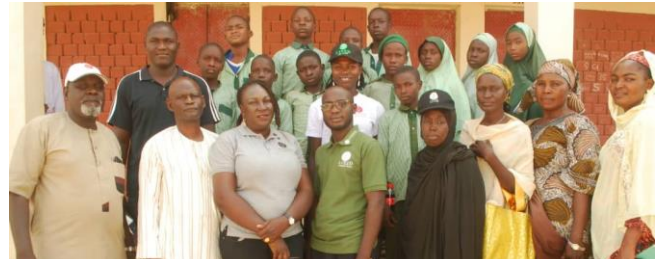
I-VEED Team with staff and students of SUBEB Wamdeo at the workshop in Gombi.