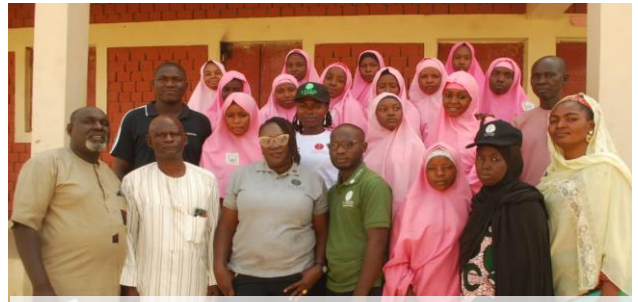
I-VEED Team with staff and students from Government Girls' Secondary School (GGSS) Gombi at the workshop in Gombi.