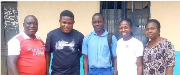
I-VEED's Admin. Secretary with a beneficiary and staff at Gido Secondary School, Bukuru during the 2025/2026 disbursement.