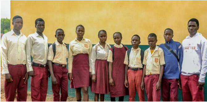
Beneficiaries from Government Secondary School (GSS) Mista Ali during the disbursement exercise in September 2025