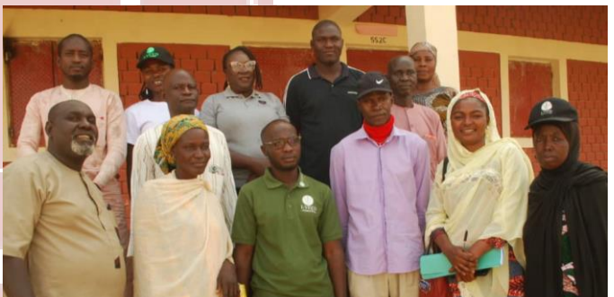
Board of Trustee member (L in the front row), Management Team, and representatives of schools at the workshop in Gombi.