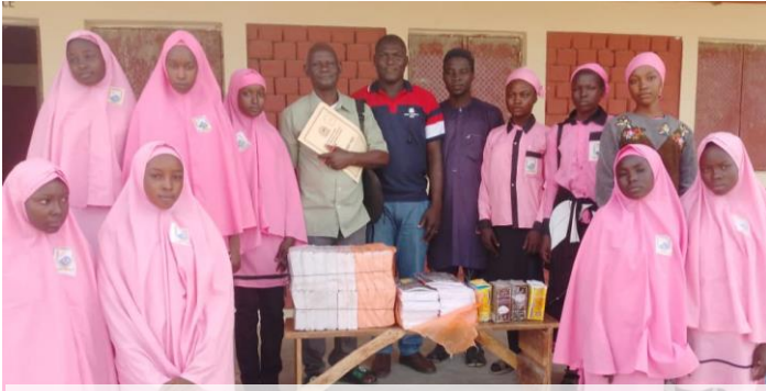
Our beneficiaries from the Government Girls' Secondary School (GGSS) Gombi with some of their teachers and I-VEED Management staff during disbursement.